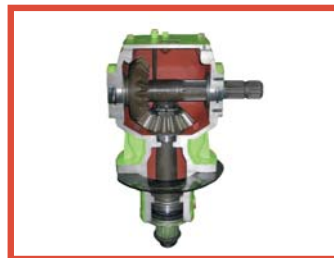
210hp Right Angle Gearboxes Heavy duty 1 3/4" input shafts. 2 3/8" tapered & splined down shafts