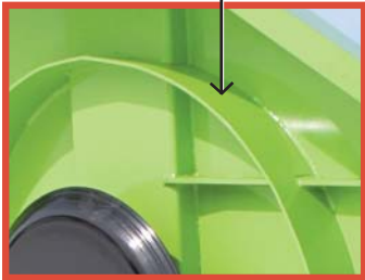
Deck protection rings are standard