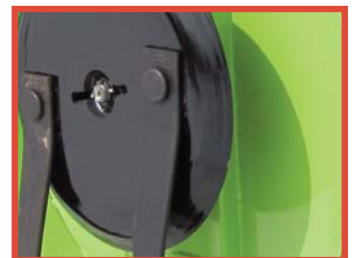
7 gauge spun formed stump jumper pans