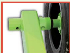
Bolt in Axles