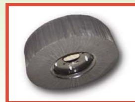
Solid Laminate Tires