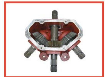
260hp heavy duty splitter box with 1 3/4" splined shafts