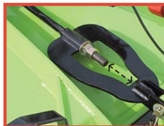
Single levelling rod with floating hitch