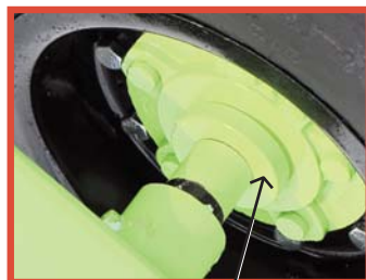
Metal seal guards on 517 hubs