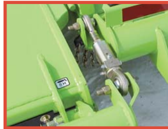
Greaseable adjustable turnbuckles for parallel levelling