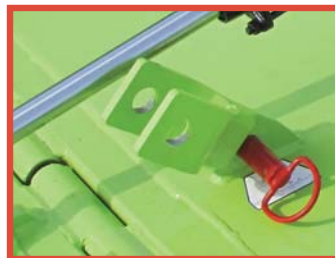
Wing lock ups