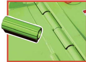
Heavy duty cast hinge line with wiper seals