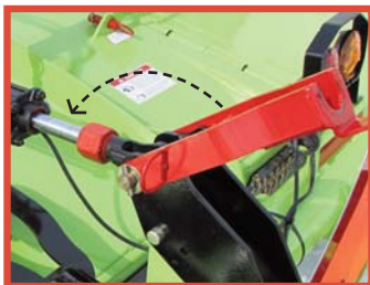
Single center lock up system

Legendary Toughness, Economically Priced