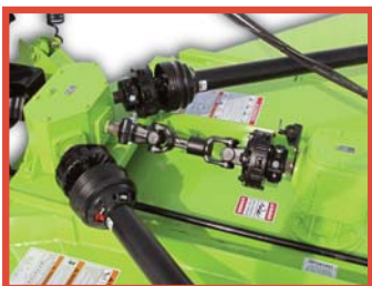
Heavy duty drive system for peak performance