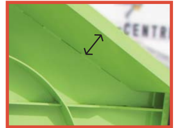
13 5/8" frame depth for maximum material flow