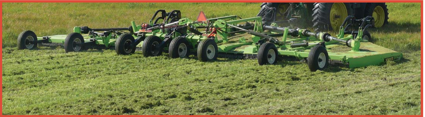
- Pasture & Airport Maintenance -