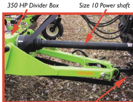
- Parallel solid tongue hitch -