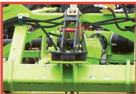
- Rubber grommet suspension -