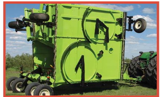
- Fixed knife unit shown above -