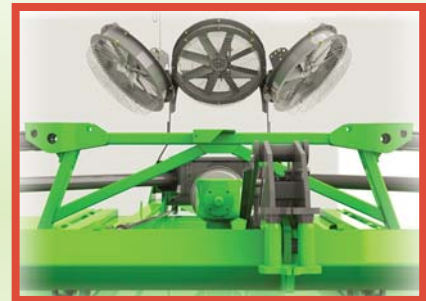
- Optional Deck Debris Fan Kit -