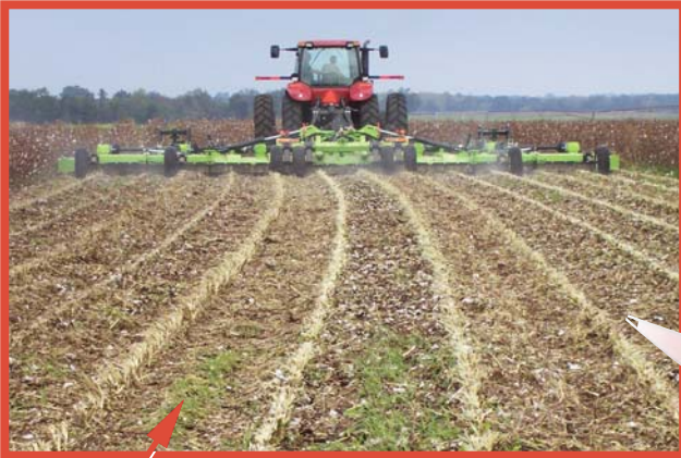
- FX-742 shattering cotton stalk -