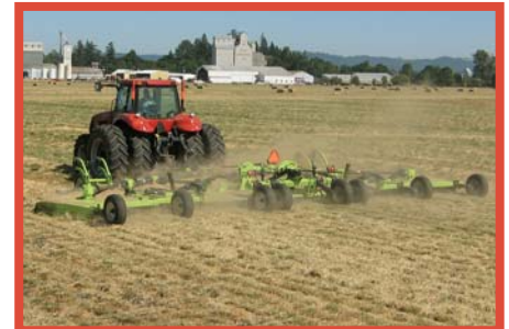
- In grass straw -