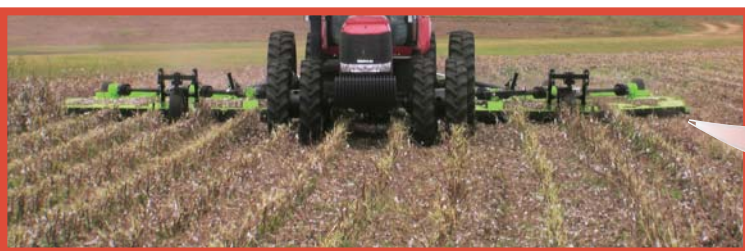
- Can accommodate 12 rows -