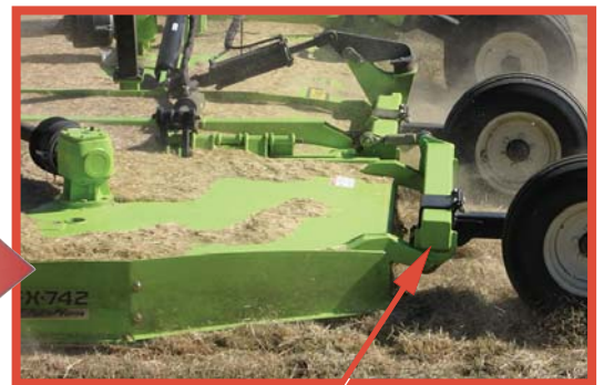
- Adjustable wheel standards for row crop spacing -