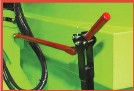
- Wing lock up -