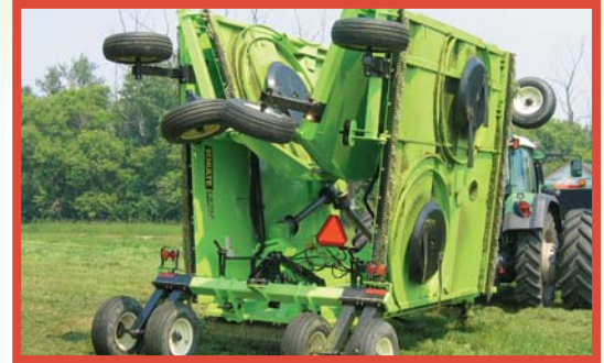
- Stump jumper unit shown above -

Tractor 80 degree CV shaft with 1 3/4" 20 spline coupler with over running clutch is standard