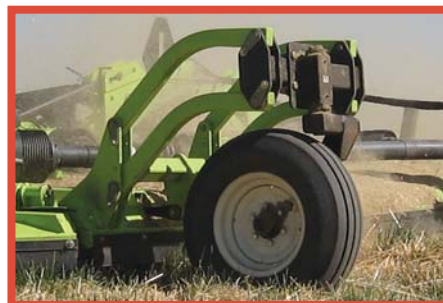
- Adjustable front castor wheels -