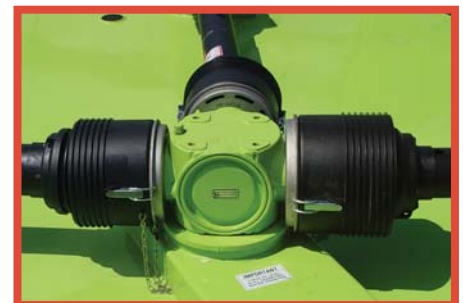
- 180hp divider box allows for unique driveline layout -