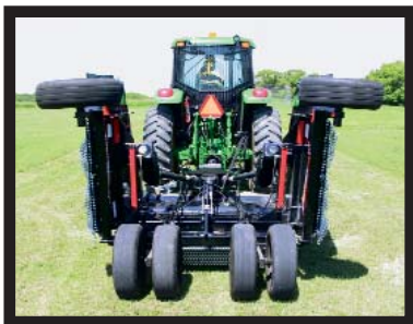
- Narrow transport width -