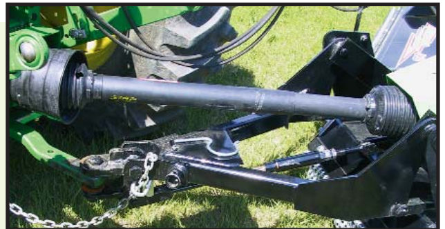
- Parallel clevis hitch -

Schulte Industries Ltd. reserves the right to change the design, material and specifications of its products without notice. Illustrations may include optional equipment and accessories, and may not include all standard equipment. Part No. 1000-160