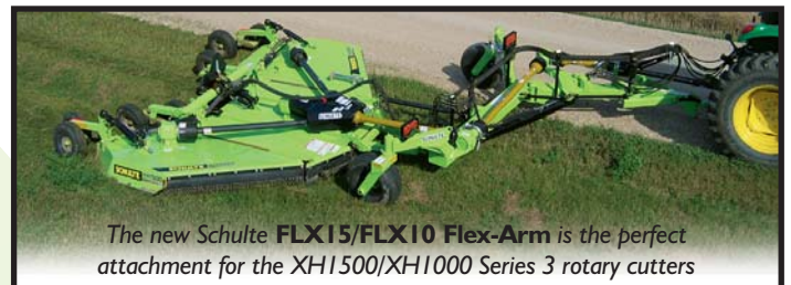
The new Schulte FLX15/FLX10 Flex-Arm is the perfect attachment for the XH1500/XH1000 Series 3 rotary cutters

Schulte Industries Ltd. reserves the right to change the design, material and specifications of its products without notice. Illustrations may include optional equipment and accessories, and may not include all standard equipment. Part No. 1000-147