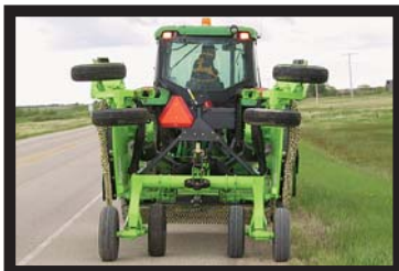
- Ultra Narrow Transport Width -