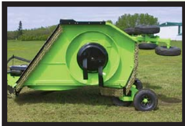
- Heavy Duty Stump Jumper & Deck Rings -