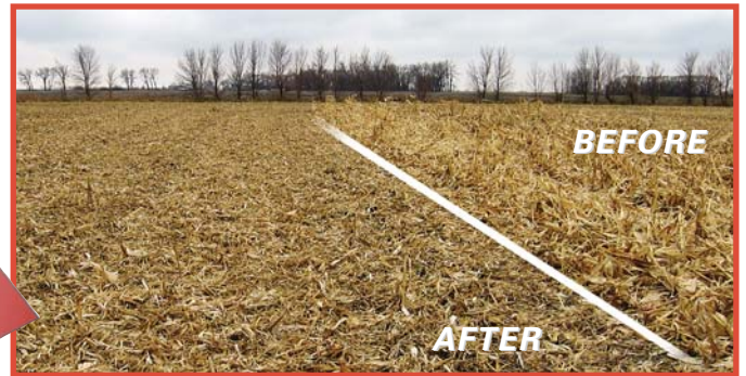
Excellent Shredding and Distribution